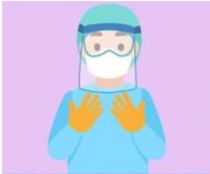
OUR NEW LOOK WITH PROTECTIVE GEAR